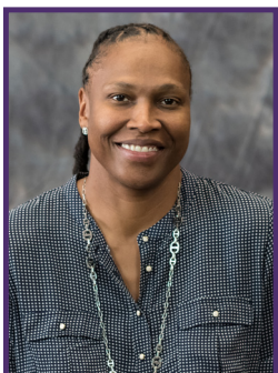
YOLANDA GRIFFITH Assistant Coach Second year at UAlbany