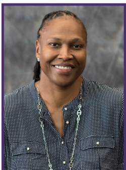
YOLANDA GRIFFITH Assistant Coach Second year at UAlbany