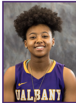
2 KYARA FRAMES Fr. / G / 5-2 Laurel, Md.