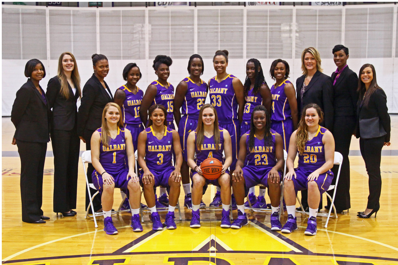
2014-15 University at Albany Great Danes

The America East three-peat by UAlbany was the first time since Maine from 1996-98. The feat was done by previously by Vermont from 1992-94 and Northeastern from 1984-86.