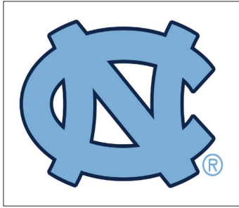
No. 2 North Carolina