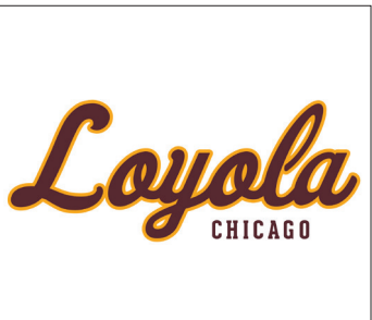
No. 13 Loyola Chicago