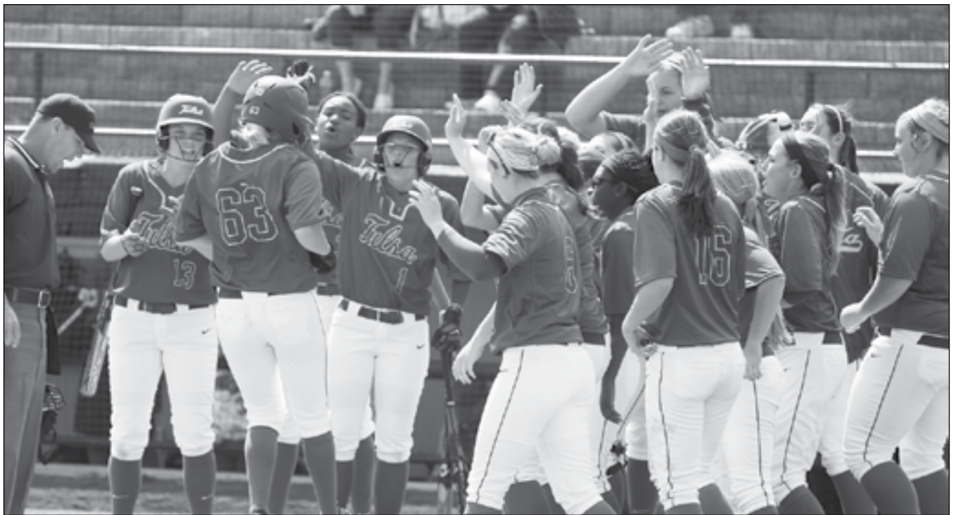
Tulsa's schedule features 15 games against seven opponents that played in the 2014 NCAA postseason, including Women's College World Series participants Baylor and Oregon.