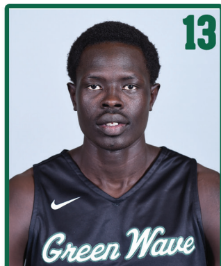
BUAY KOKA C · 7-0 · 200 · FR NASIR, SOUTH SUDAN