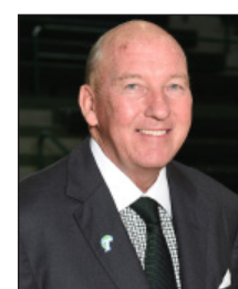
MIKE DUNLEAVY, SR. HEAD COACH FIRST SEASON