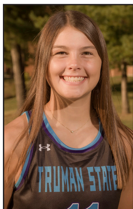
Sophomore 5-7 Guard Kansas City, Mo. Staley HS