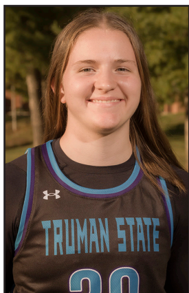
Freshman 5-9 Olathe, Kan. Olathe East