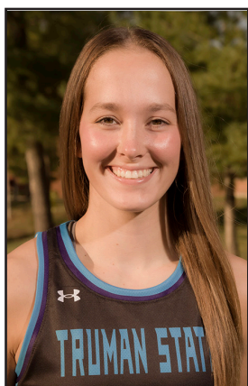
Senior 5-10 Ames, Iowa Gilbert