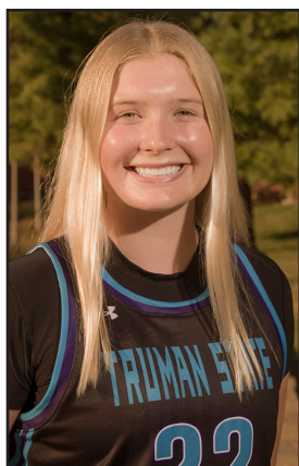
Sophomore 5-11 Merrill, Wis. Wausau West