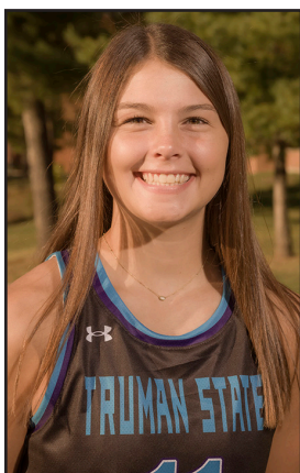
Sophomore 5-7 Guard Kansas City, Mo. Staley HS