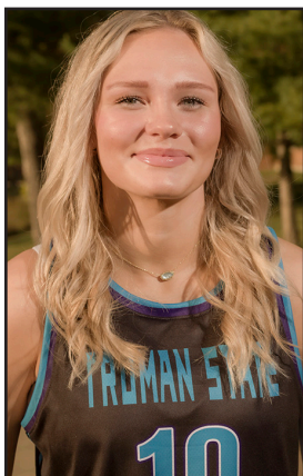
Freshman 5-10 Waukee, Iowa Waukee