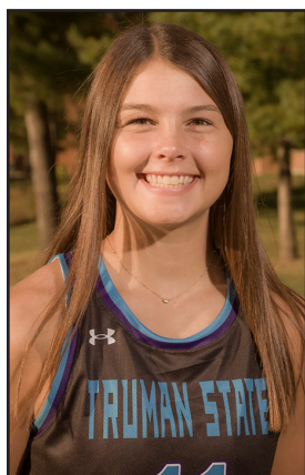
Sophomore 5-7 Guard Kansas City, Mo. Staley HS