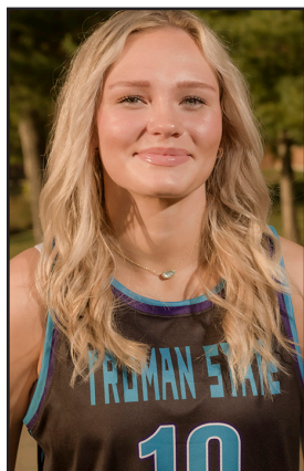
Freshman 5-10 Waukee, Iowa Waukee