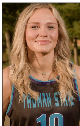
Freshman 5-10 Waukee, Iowa Waukee