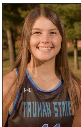
Sophomore 5-7 Guard Kansas City, Mo. Staley HS