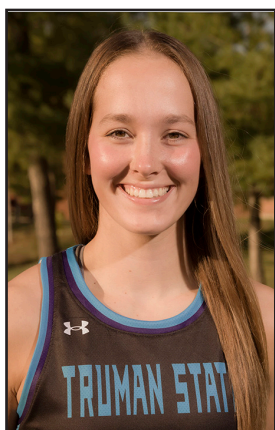
Senior 5-10 Ames, Iowa Gilbert