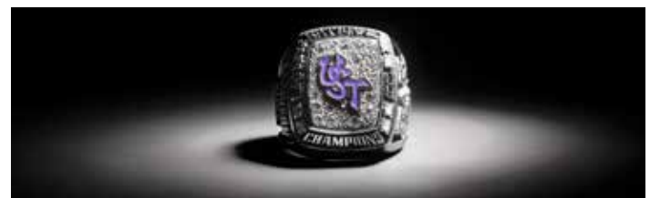
The 2009 University of St. Thomas baseball team's national championship ring.

The 2001 Tommies were ranked first in the nation and came into May with a 27-4 record. Then a 2-4 finish to the regular season dipped St. Thomas to third in the final conference standings. But the Tommies caught fire and won the MIAC postseason tournament, then went 7-2 in the NCAA playoffs. Their 8-4 victory over Marietta (Ohio) let them capture the first NCAA baseball team title in school and conference history. In 2009, Tommie pitchers recorded a 2.12 ERA in 12 NCAA playoff games and helped post a 6-0 record in elimination games at regionals and nationals.