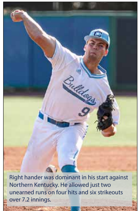
Right hander was dominant in his start against Northern Kentucky. He allowed just two unearned runs on four hits and six strikeouts over 7.2 innings.