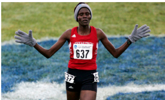
SALLY KIPYEGO - THREE-TIME NCAA CHAMPION (2006-08)