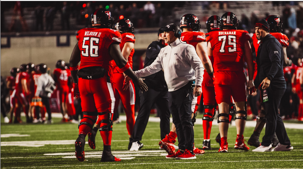
▲ Texas Tech enters its third season under head coach JOEY MCGUIRE , who is the first head coach in program history to lead the Red Raiders to a bowl victory in each of his first two seasons as well as a winning conference record. Texas Tech defeated Ole Miss in the TaxAct Bowl in 2022 and then Cal this past season in the Independence Bowl.