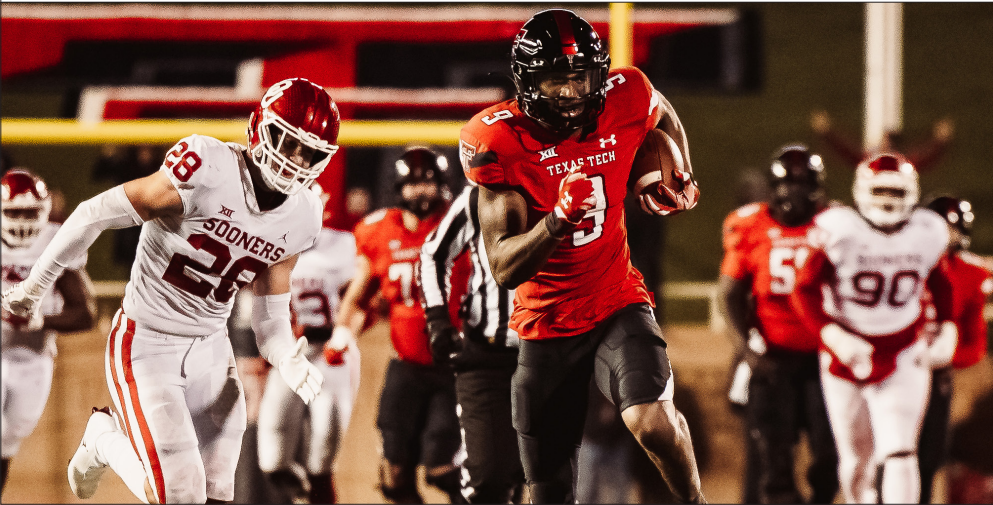
▲ Texas Tech was a perfect 3-0 in overtime games during the 2022 season, which included memorable wins over both Texas and Oklahoma during Big 12 play. It marked the first time in program history where the Red Raiders have topped both the Longhorns and Sooners during the same season.