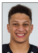
PATRICK MAHOMES Junior Quarterback