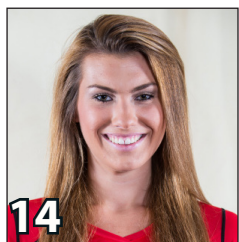
14 Ally Standard 6-4 • MB • SO-TR San Angelo, Texas