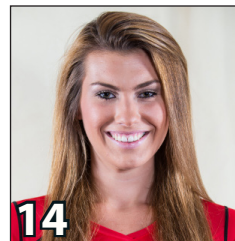
14 Ally Standard 6-4 • MB • SO-TR San Angelo, Texas