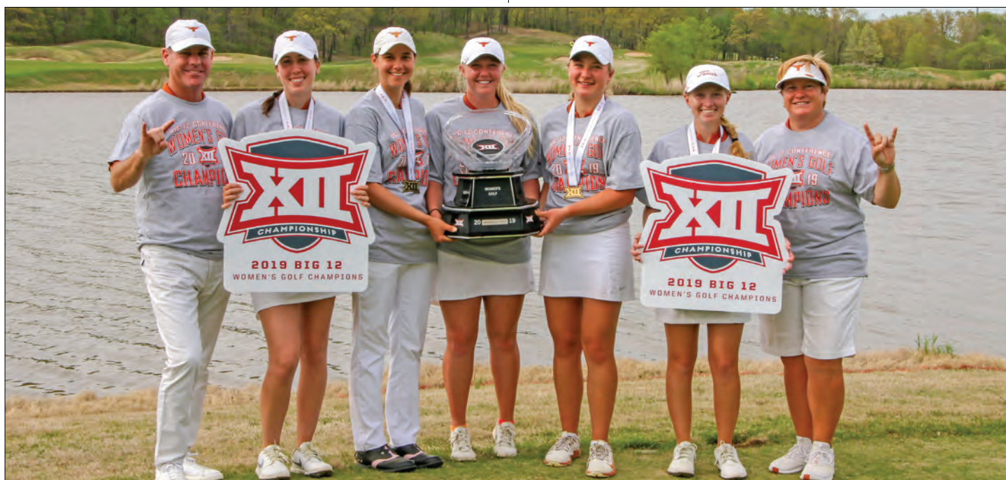
The 2019 Big 12 Conference Champion Texas Longhorns.