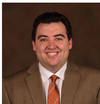
SEAN CARTELL COMMUNICATIONS