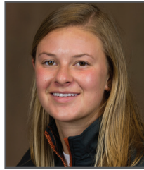
3 SYDNEY SHUTTER 5-6 Sr. F Austin, Texas