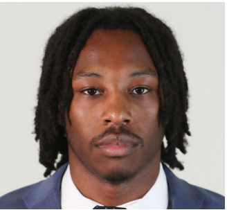
9 COLLIN COURSE