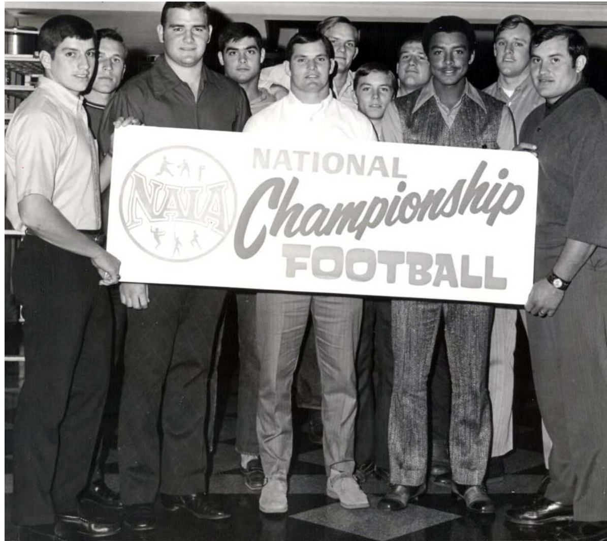
Javelina players at the 1970 NAIA national championship football game in Greenville, S.C. The Javelinas defeated Wofford (S.C.), 38-7, for the title.