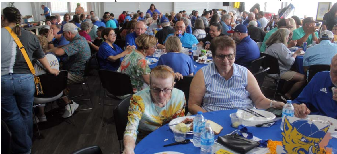
Javelina fans at a barbecue dinner from Big House Burger at the annual Javelina Club BBQ and Auction last weekend in the Touchdown Zone in Javelina Stadium.