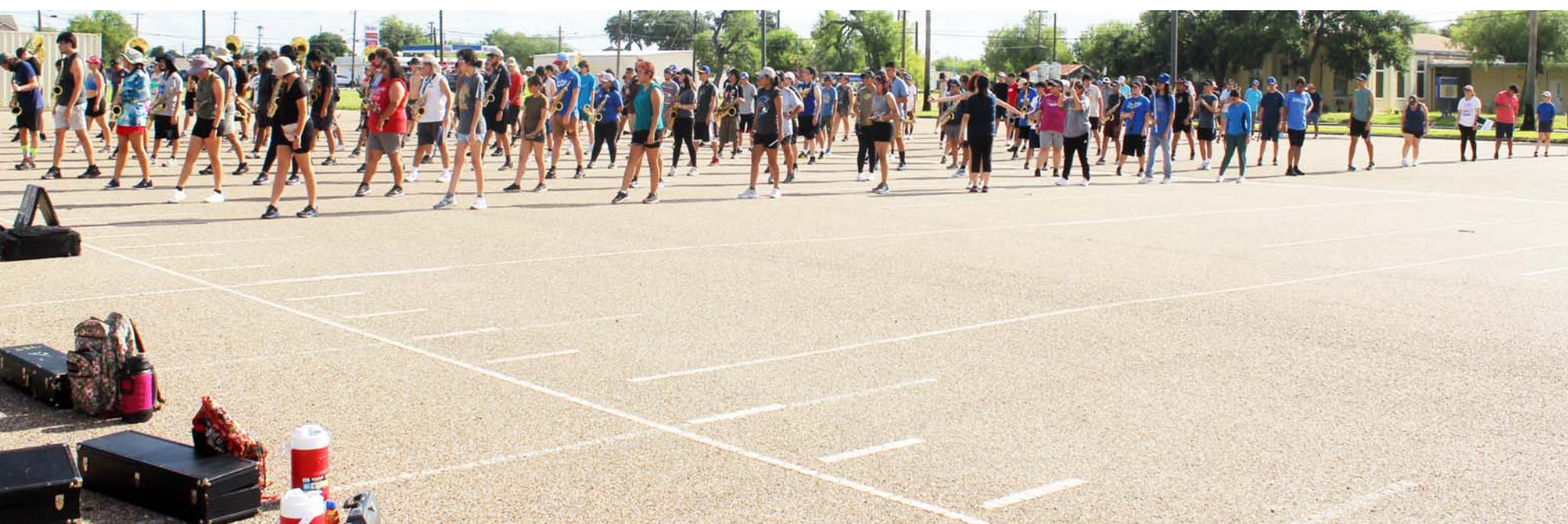
The Javelina Marching Band practices Saturday morning as it prepares for the opening football game Aug. 29 with Colorado-Mesa in Javelina Stadium. The Javelina band is one of the top marching bands in Texas.