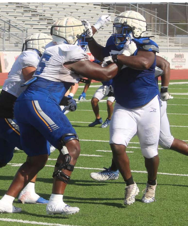
Javelina offensive and defensive linemen battle during an intrasquad scrimmage in Javelina Stadium Saturday morning.