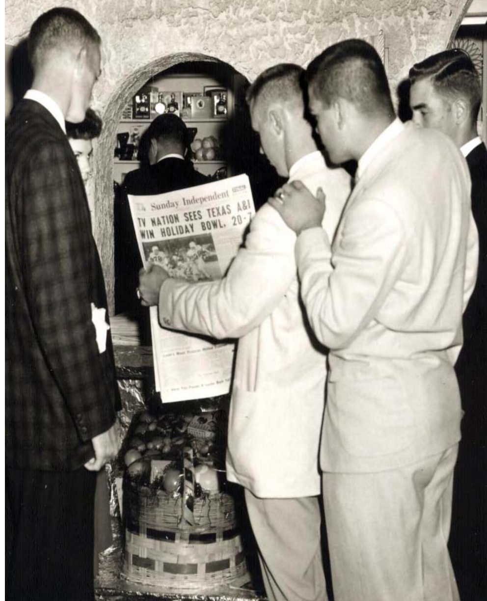
Javelina players read the headlines the morning after their victory over Lenoir-Rhyne (N.C.) in the 1959 Holiday Bowl. The Javelinas won the NAIA national championship before a live CBS national television audience. It was the first of seven national titles for the Javelina football program.