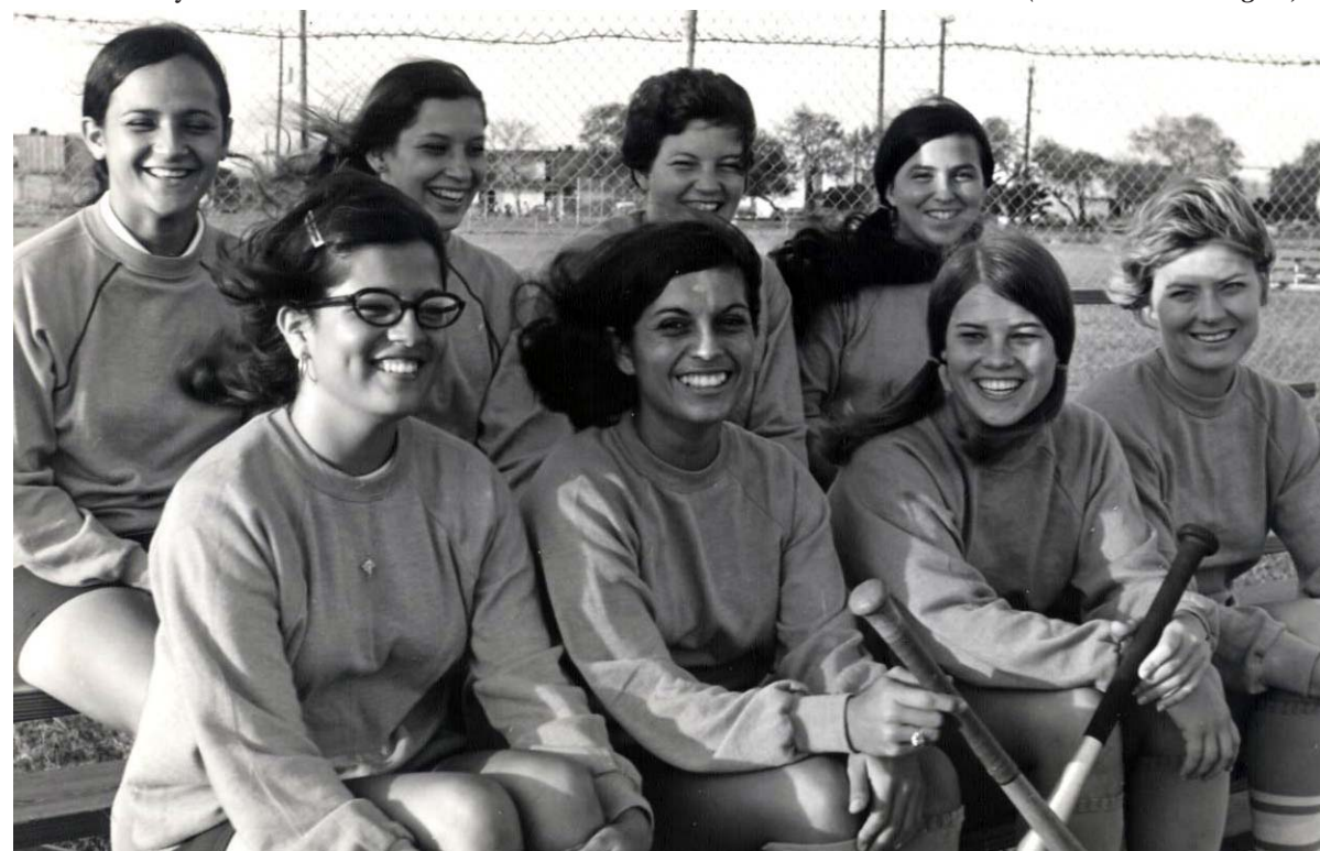
Slow pitch softball was one of the sports when the Javelina women's intercollegiate program was started in 1968. This will be the 55th anniversary of the establishment of the program. The current fast pitch softball intercollegiate program was started in 1997.