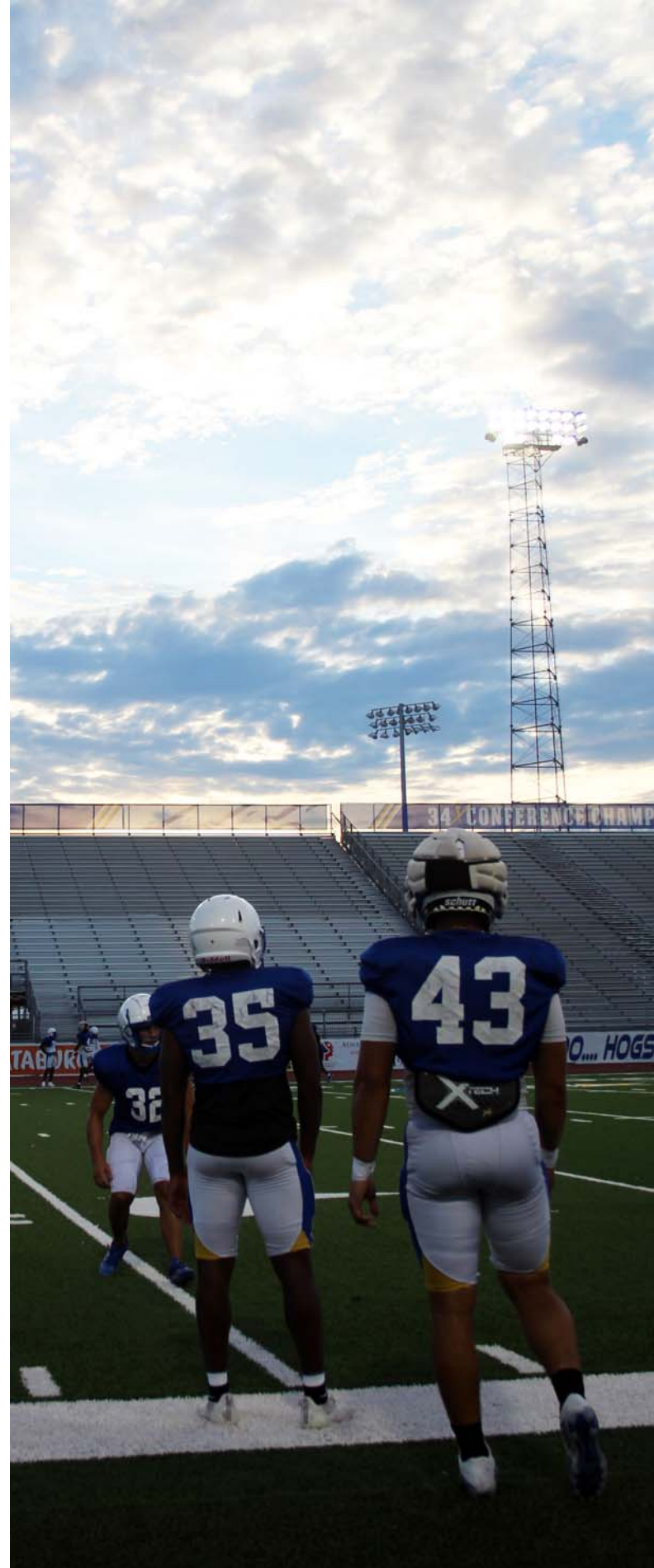
For the Javelina football fan, nothing can be more exciting than a South Texas sunset, Javelina Stadium lights on and football season underway.