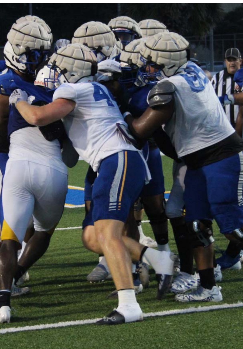
The offensive and defensive lines battle during an intrasquad scrimmage last week.