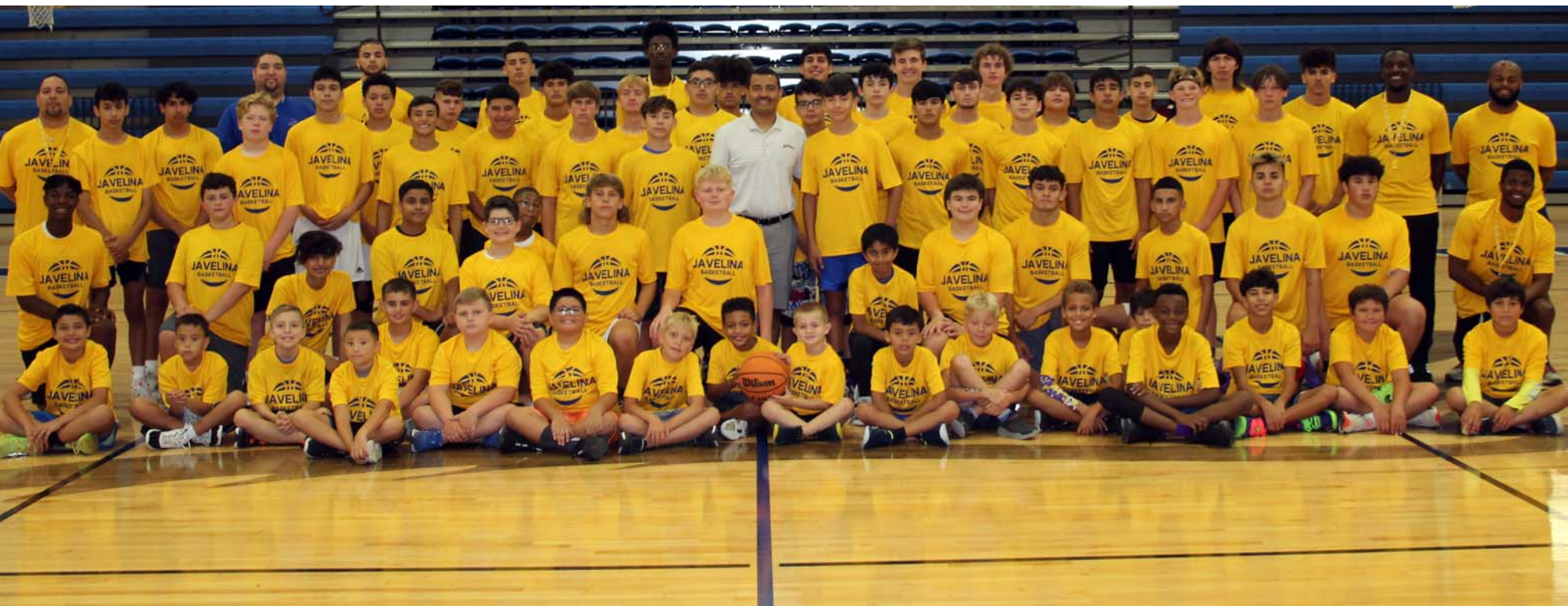
The Javelina basketball camp was held in the Steinke Center this week.