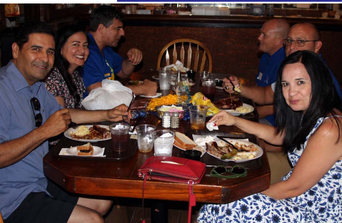
Fans, alumni and coaches at the Javelina Coaches Caravan Friday night in Corpus Christi's The Bar-B-Q Man Restaurant.