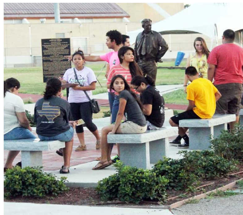
Fans gather at Steinke Plaza during an event in Javelina Stadium.

Although his entire head coaching career was at a college division school in South Texas, the milestones the Javelinas accomplished under his guidance can stand up to those posted by any college, at any level, at any time in college football history.