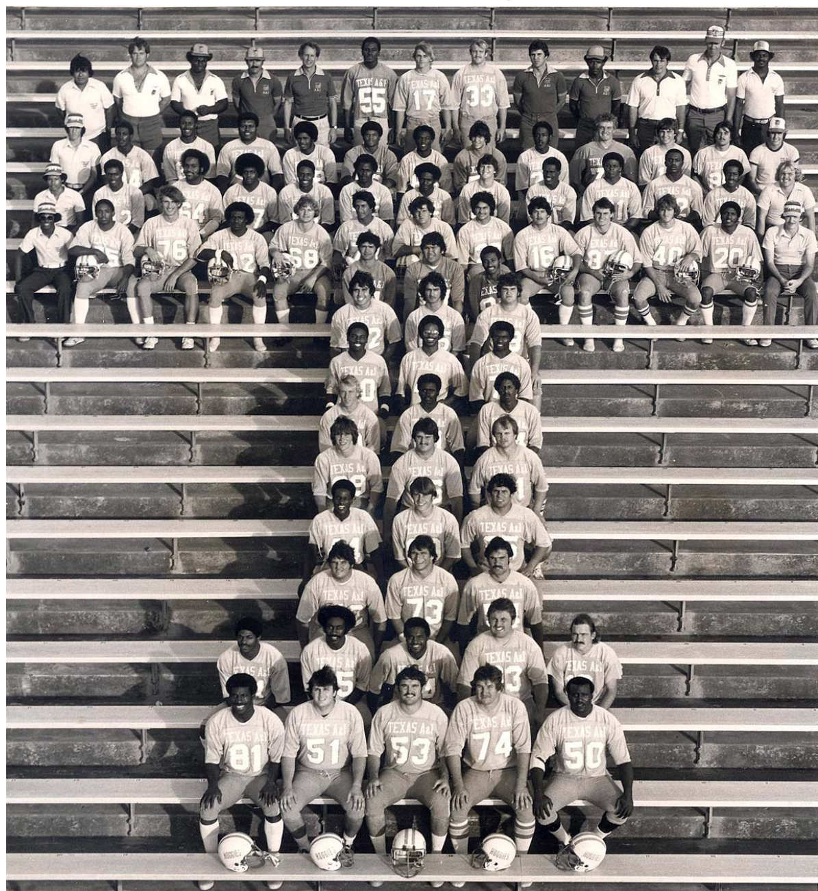
1979 Javelina Football Team