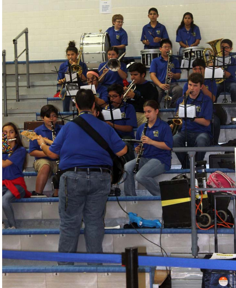
Visiting Band The Ricardo Middle School Band played at the Javelina men's and women's games last week in the Steinke Center.