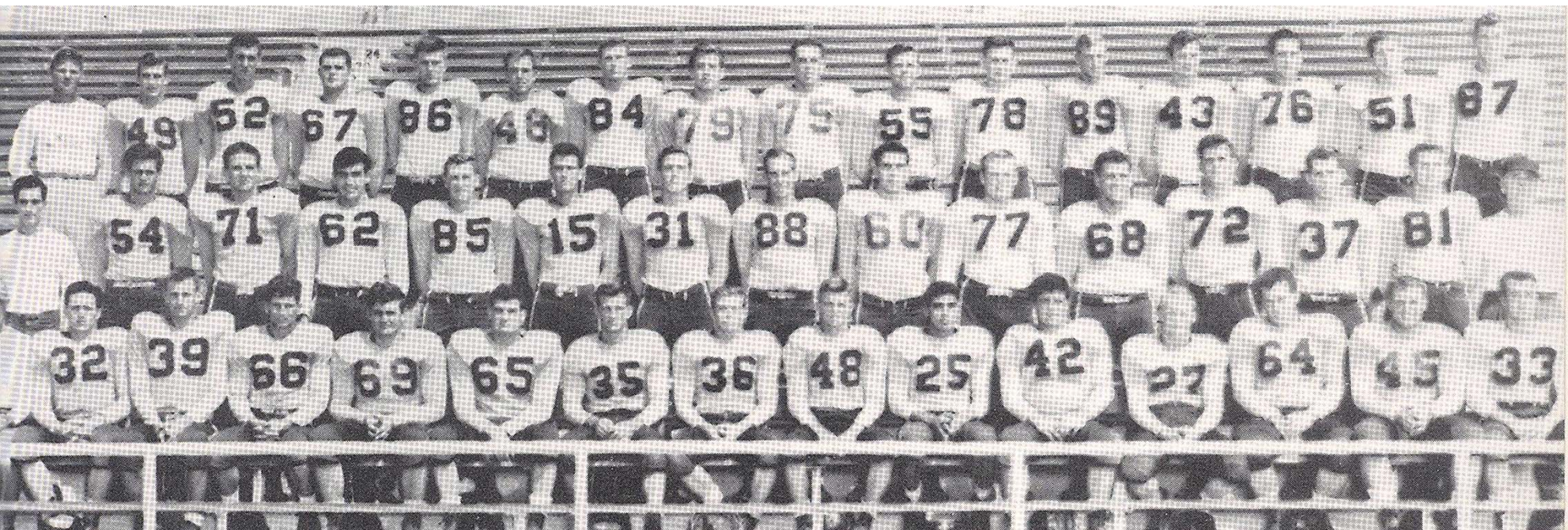
1951 Javelina Football Team