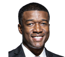
AC TJ CLEVELAND