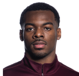
5 JACARI LANE