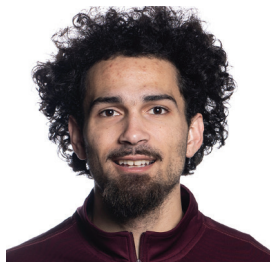
2 POP ISAACS