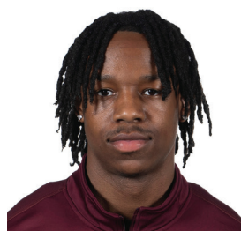
1 JOSH HOLLOWAY