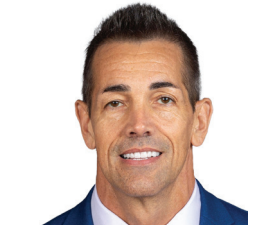
SC DARBY RICH