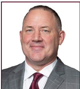
BUZZ WILLIAMS HEAD COACH 4TH SEASON