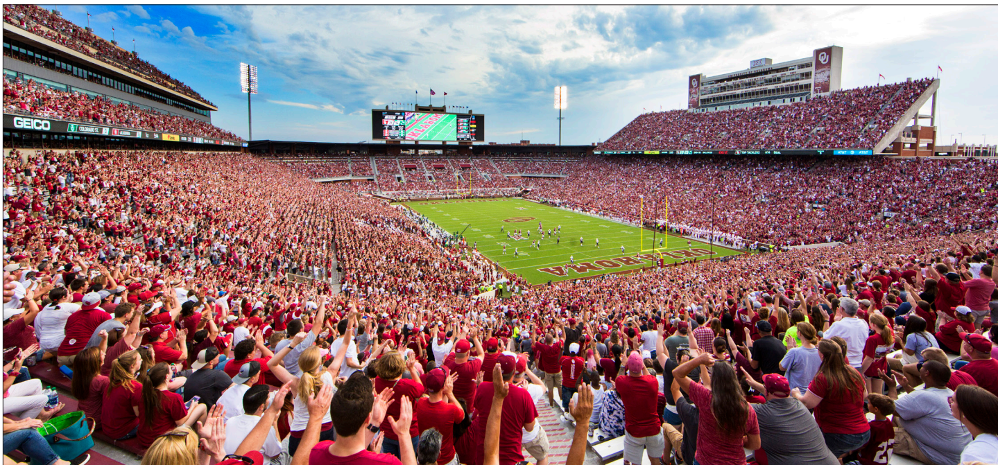
OU's $160 million stadium renovation and modernization project bowled in the south end of the facility and added premium seating and A 62-foot-by-38-foot video board.