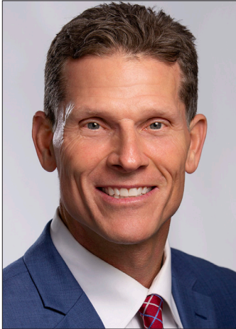
Brent Venables Head Coach