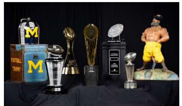
12 National Titles & 45 Big Ten Championships