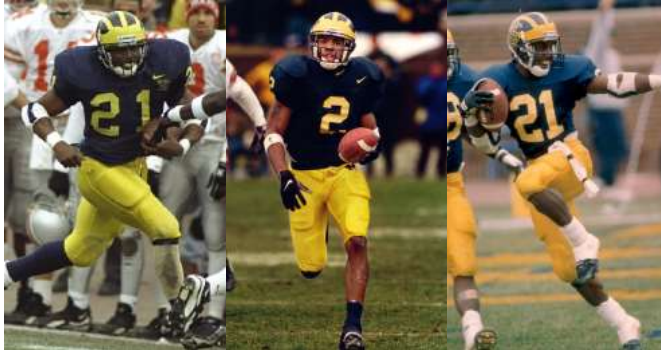
"The Game" between Michigan and Ohio State has been selected as the greatest rivalry in all of sports