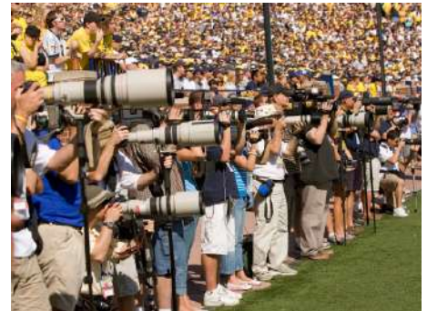
All-Time NCAA Leader in TV Appearances