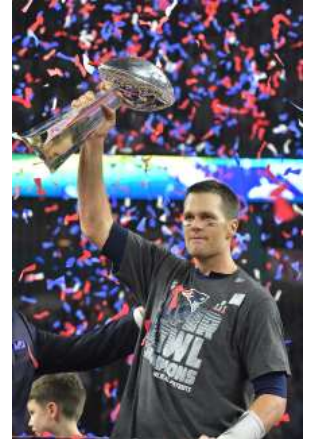
Tom Brady 7-time Super Bowl Champion 5-time Super Bowl MVP