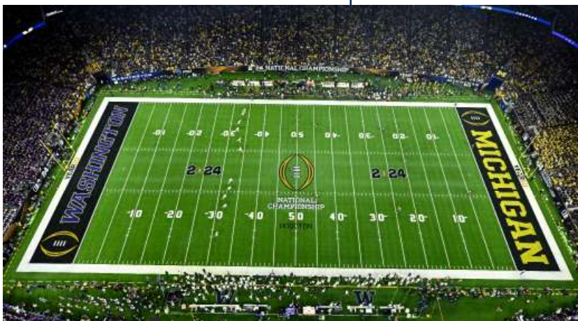
Three College Football Playoff Appearances: 2022, 2023, 2024