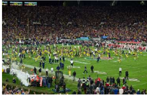
21 Rose Bowl Appearances The most of any Big Ten Conference school and the second-most all-time by any school