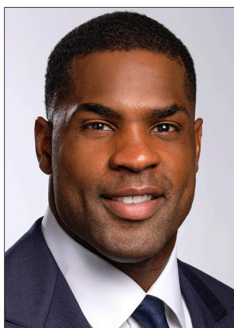
DeMarco Murray Running Backs