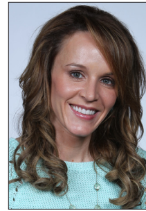
JACKIE STILES Assistant Coach 2nd Year at Oklahoma