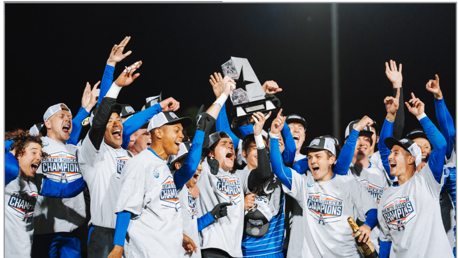
2023 CONFERENCE REGULAR SEASON CHAMPIONS