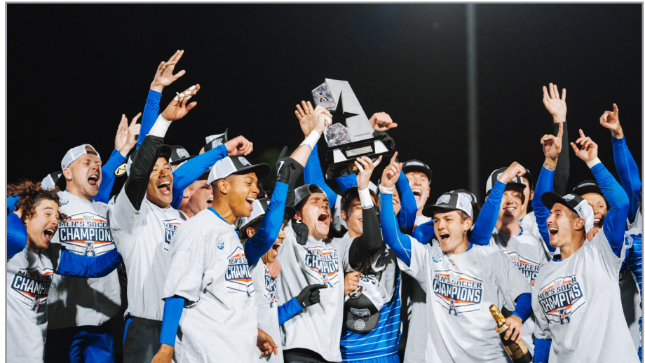
2023 CONFERENCE REGULAR SEASON CHAMPIONS