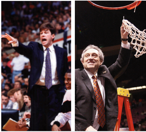
He was an assistant coach at Oklahoma State (1992-93) for Eddie Sutton (College Basketball HOF 2011). The Cowboys finished second in the Big Eight and reached the NCAA Second Round.