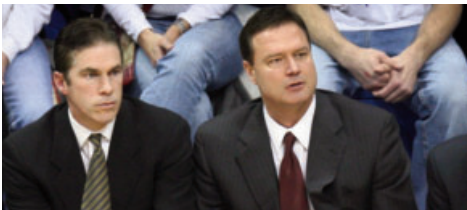
He was an assistant coach under Bill Self for five seasons. At Illinois in 2002-03, their squad won the Big Ten Tournament. From 2003-07 at Kansas, their teams won 3 Big 12 titles, a pair of Big 12 Tournaments and made the Elite Eight twice.