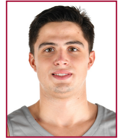
#20 CHRIS ARIZIN. G, 6-3, 195, Fr. Media, Pa.