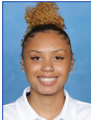
#33 Courtesy Clark