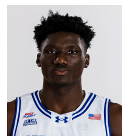
#54 - ERHERIENE

DOUBLE-DOUBLES Season --> -- Career --> -- Streak --> -- DOUBLE-FIGURE SCORING Season --> -- Career --> -- Streak --> -- 20+ POINT GAMES Season --> -- Career --> -- Streak --> -- 5+ ASSIST GAMES Season --> -- Career --> -- Streak --> --