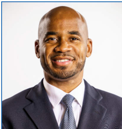
Desire. Dedication. Discipline.