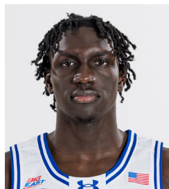
#1 - DAR

DOUBLE-DOUBLES Season --> 1 Career --> 6 Streak --> 1 DOUBLE-FIGURE SCORING Season --> 5 Career --> 61 Streak --> 1 20+ POINT GAMES Season --> -- Career --> 21 Streak --> -- 5+ ASSIST GAMES Season --> 6 Career --> 39 Streak --> 5