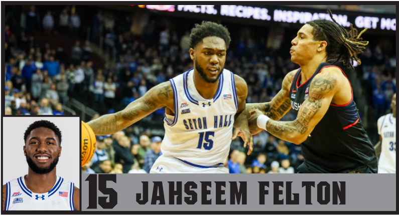
Sophomore • Guard • 6-5 • 205 • Charlotte, N.C. / Combine Academy