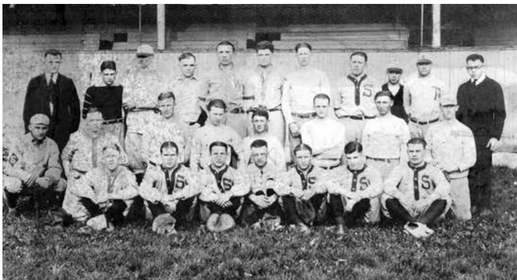
The 1922 baseball team - Pennsylvania Normal School Champions