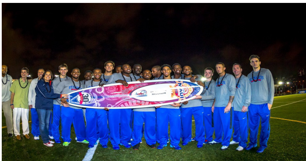
EA Sports Maui Invitational

*EA Sports Maui Invitational # Barclays Center