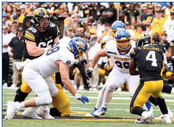
The South Dakota State defense held Iowa without a touchdown and limited the Hawkeyes to 57 rushing yards in a narrow 7-3 setback in the 2022 season opener.

Dustman also handled the punting duties for the Jackrabbits, averaging 41.5 yards on 11 attempts.