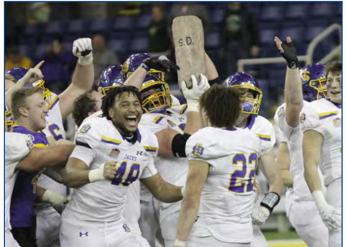
South Dakota State reclaimed the Dakota Marker and clinched the Missouri Valley Football Conference's automatic playoff bid with a 27-17 road win at North Dakota State in the regular season finale April 17.