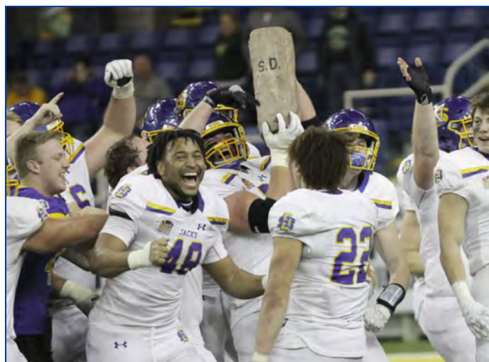
South Dakota State reclaimed the Dakota Marker and clinched the Missouri Valley Football Conference's automatic playoff bid with a 27-17 road win at North Dakota State in the regular season finale April 17.